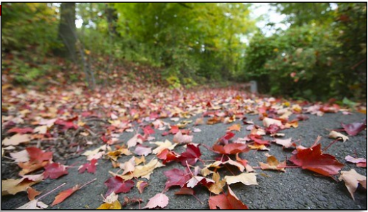
point, and wind. Let's hope for an easy winter season! Submitted by Ben Darkow